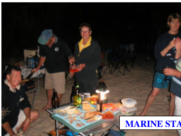
MARINE STADIUM SEPT 04